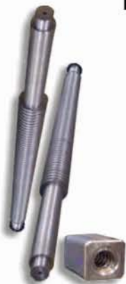
Screw & Nut